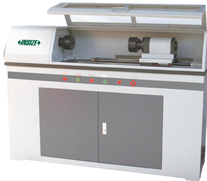
UTM-TT500 type B