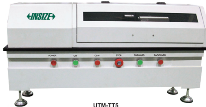
UTM-TT5 type A